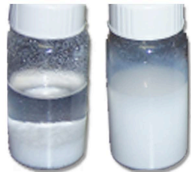
Titanium dioxide in hexanes with (right) and without (left) POSS coating